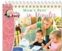
Mom's Best in Minutes