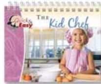
The Kid Chef