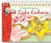
Christmas Cookie Exchange