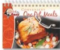
Convenient One Pot Meals