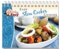
Easy Slow Cooker Cuisine