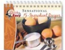
Sensational 5-Ingredient Recipes