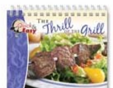
The Thrill of the Grill