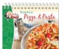
Simple Pizza & Pasta