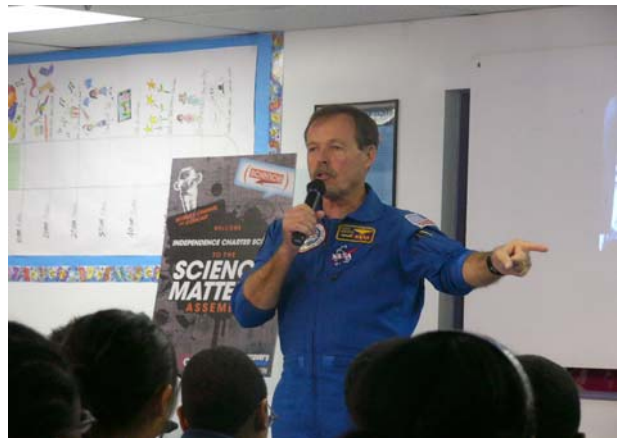
Astronaut Robert "Hoot" Gibson challenges ICS students to follow their dreams no matter what obstacles await them in their lives.